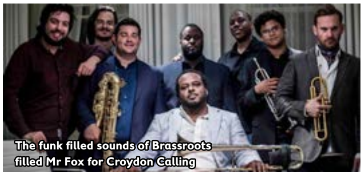
The funk filled sounds of Brassroots filled Mr Fox for Croydon Calling

Coffee Shoter in High Street, Mr Fox in Surrey Street and The Front Room in St George's Walk have all hosted gigs as part of the scheme, which has been piloted throughout November.