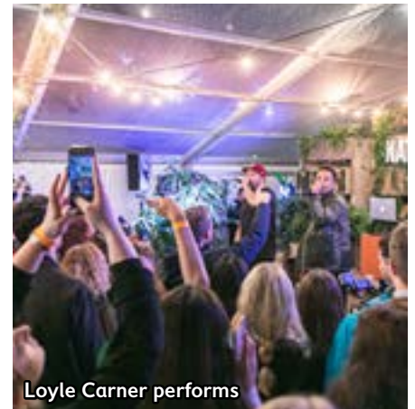
Loyle Carner performs

The BRIT School has also benefited from the partnership, with a new meditation garden.