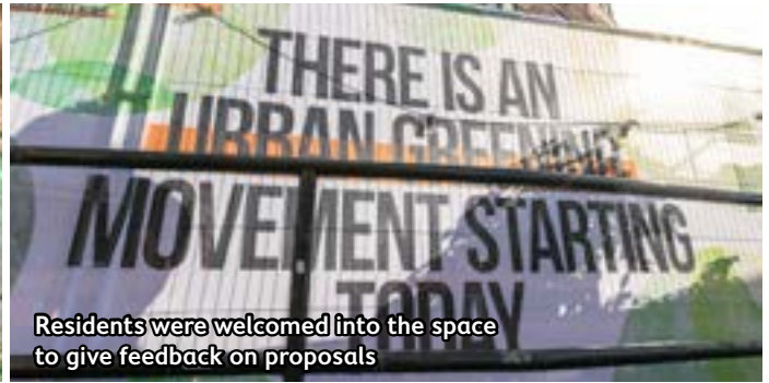
Residents were welcomed into the space to give feedback on proposals