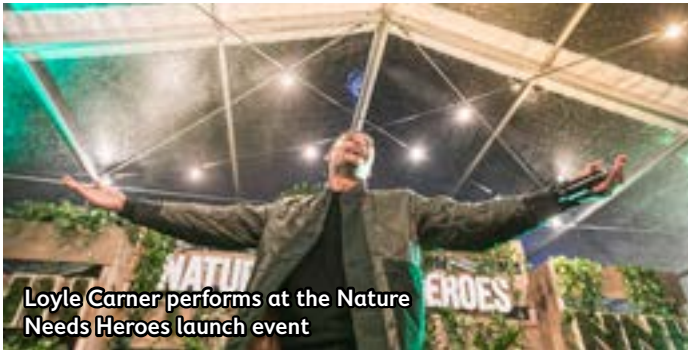
Loyle Carner performs at the Nature Needs Heroes launch event