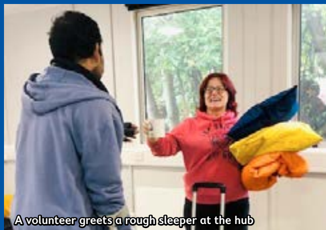
A volunteer greets a rough sleeper at the hub

The council and partners already provide wider support