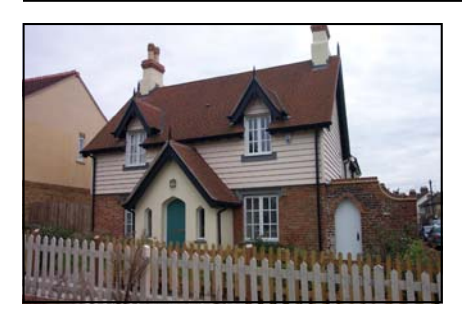
88 Woodside Green, Woodside

8.1 The Local List is now available on the Council's website which includes the name and address of each building along with an architectural description, its reason for inclusion and a photograph.