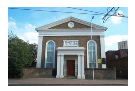
Baptist Chapel, Tamworth Road, Broad Green