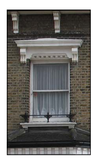
145 Brigstock Road, Bensham Manor