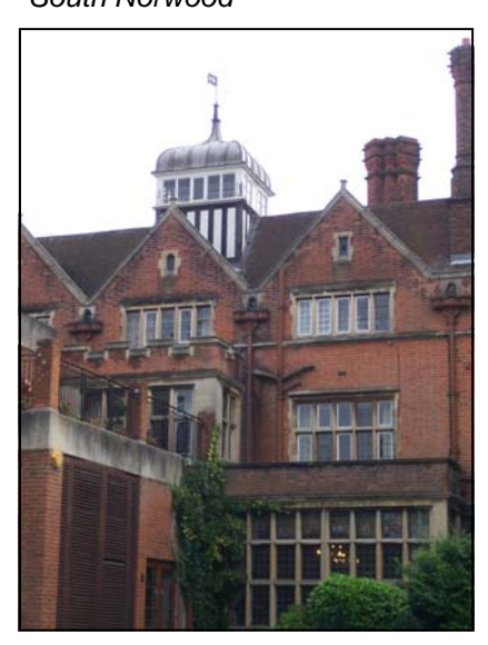
Selsdon Park Hotel, Addington Road, Selsdon and Ballards