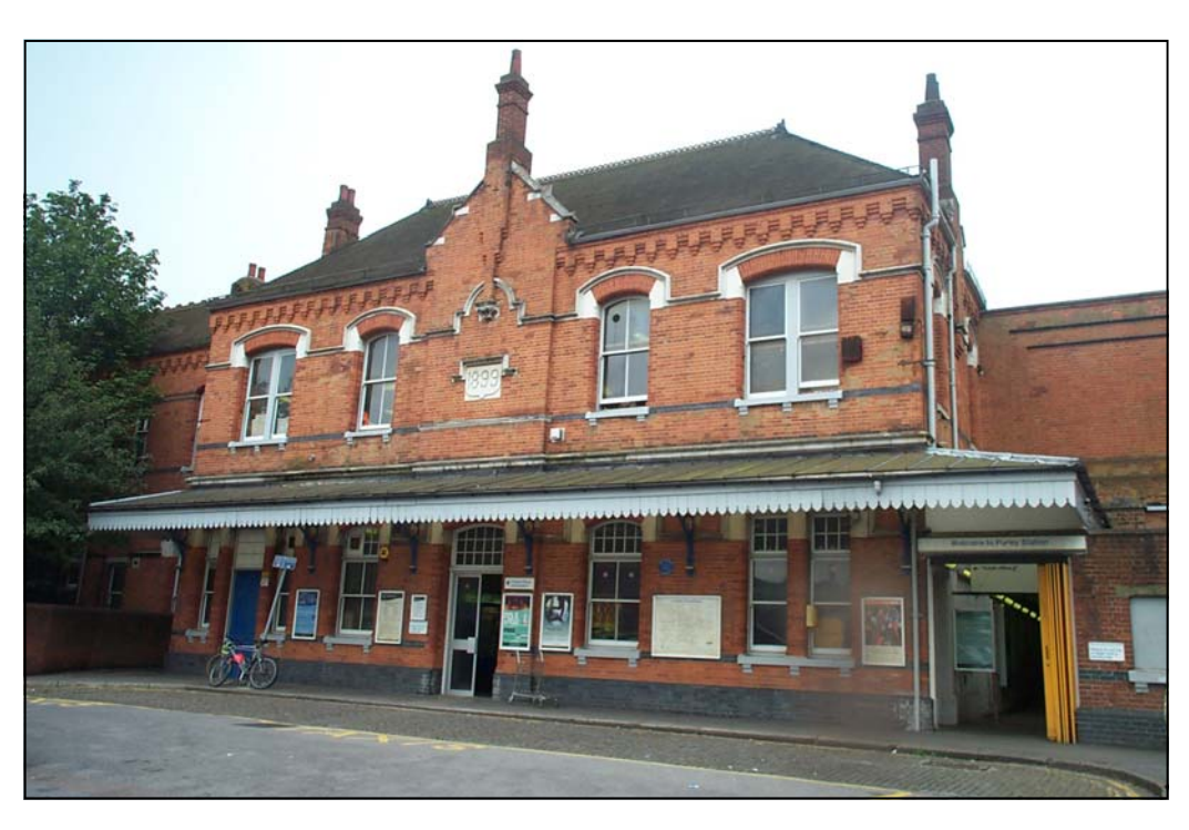
Purley Station, Station Approach, Purley