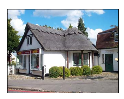
190 Wickham Road, Heathfield