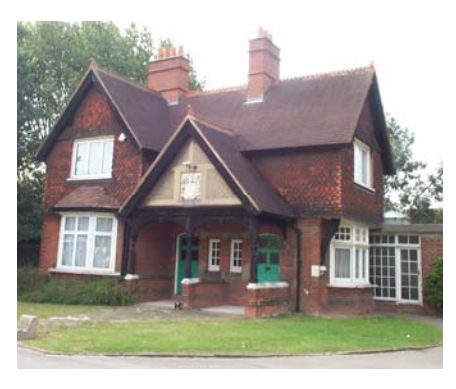
The Lodge, Mitcham Road, West Thornton