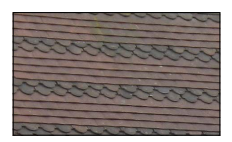
37 Beulah Hill, Upper Norwood