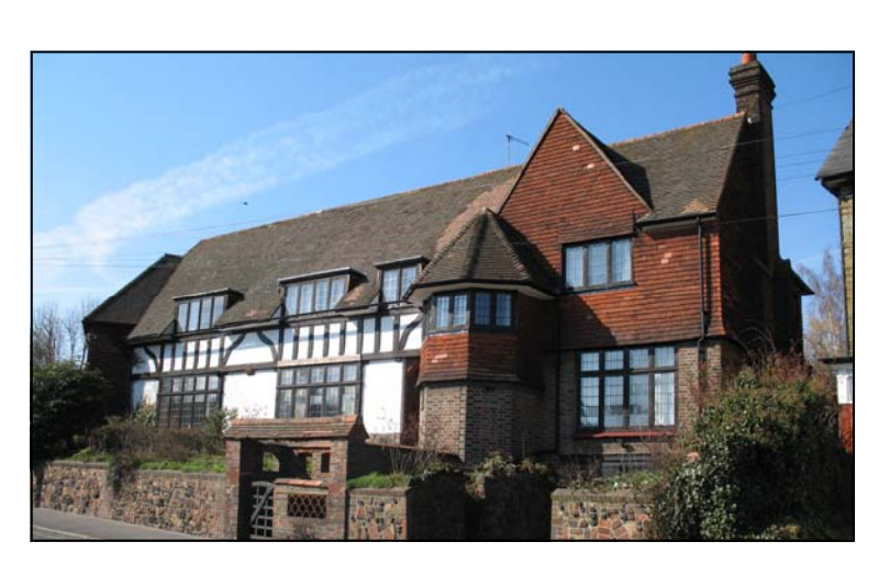
49 Croham Road, Croham