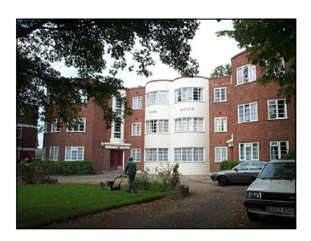
York House, Selhurst Road, Selhurst