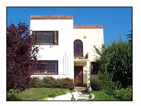
45 Brancaster Lane, Purley