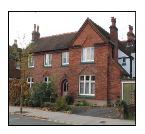
31 Elgin Road, Addiscombe