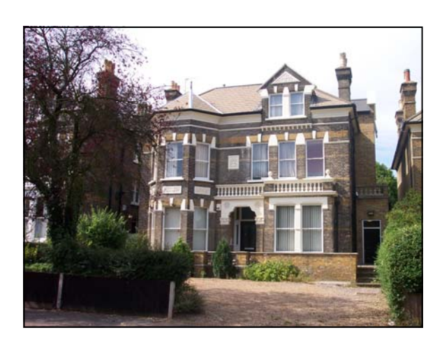
13 Harold Road, Upper Norwood