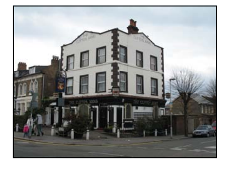
The Clifton Arms PH, Clifton Road, Selhurst

Owners are encouraged to carry out regular maintenance in order to safeguard the historic fabric and avoid the need for more costly repairs in the future. Continued inclusion on the Local List may help in maintaining the value of the property.