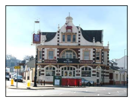
The Red Deer PH, Brighton Road, Croham