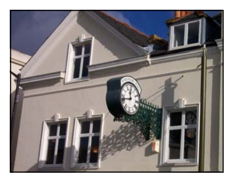
Foresters Hall, 35-37 Westow Street, Upper Norwood

Development rights. However, owners are encouraged by the Council to consider the special local interest, design quality and appropriate materials.