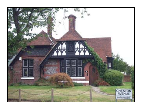
377 Wickham Road, Shirley