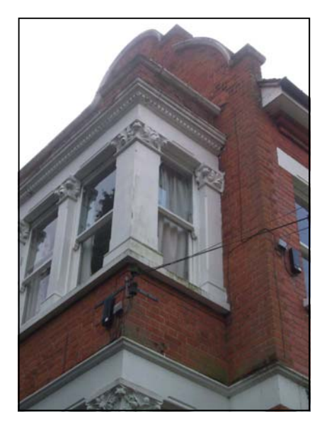
48 Uplands Road, Kenley