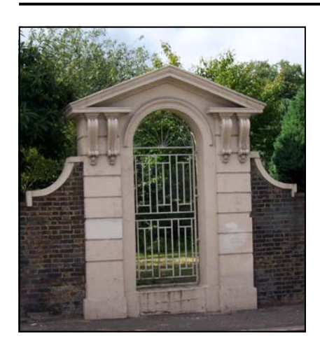
Westow Park Arch, Church Road, South Norwood