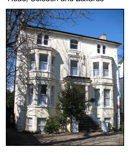
154 Church Road, Upper Norwood