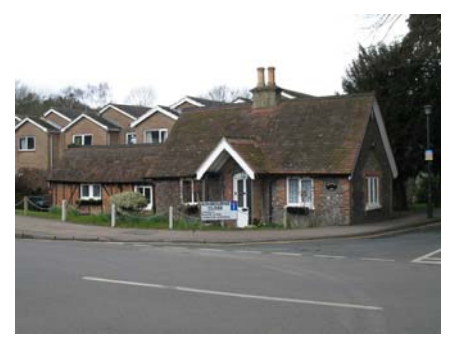
Ashdown Park Lodge, Ashbourne Close, Coulsdon East