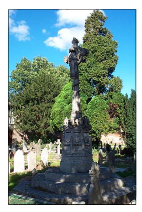
Memorial, Addington Village Road. Heathfield