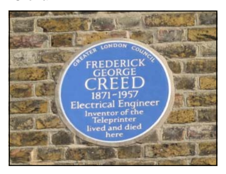
20 Outram Road, Addiscombe