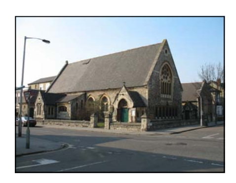
South Croydon United Church, Aberdeen Road, Fairfield