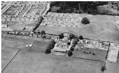
Aerial photograph, 1929