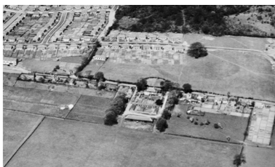
Aerial photograph, 1929