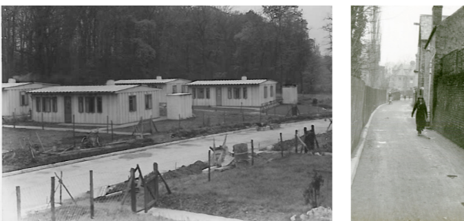
Images from top, left to right: Tylecroft Road; Northbrough Road; Beulah Grove; Northbrough Road, bombed housing prior to building of the Handcroft Estate, prefabs in Auckland Rise; Violet Lane