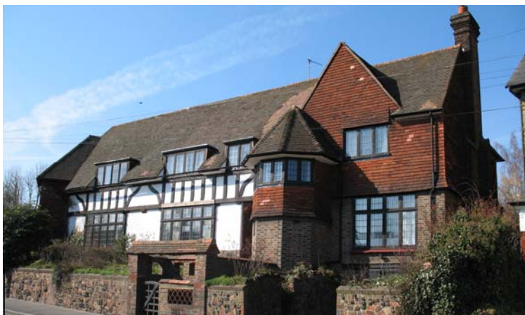
49 Croham Road, Croham

2.1 The Local List stands in addition to the Statutory List which is compiled by the Secretary of State for Culture, Media and Sport under the Planning (Listed Buildings and Conservation Areas) Act 1990, on advice from English Heritage.