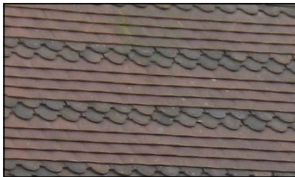
37 Beulah Hill, Upper Norwood