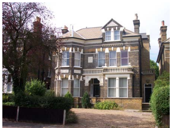
13 Harold Road, Upper Norwood