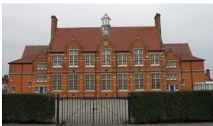
Bensham Manor School, Ecclesbourne Road, Bensham Manor

3.3 A Local List can be effective in preventing damaging development and is a useful tool in improving the image and status of the borough regionally or nationally through recognition of its cultural assets.