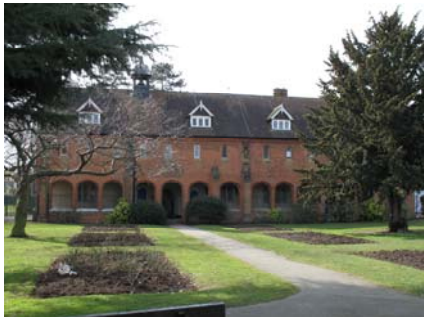
Ashburton Park Library, Lower Addiscombe Road, Ashburton

A list of addresses included in the Local List is provided in the appendices of this document.