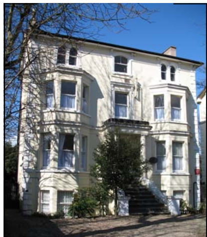
154 Church Road, Upper Norwood

5.2 Proposals for demolition will be assessed against the same criteria as listed buildings as contained in PPG 15 paragraphs 3.16 to 3.19. The Council will need to be satisfied that the benefits of demolition and redevelopment outweigh any losses in the local public interest. The Council will adopt a presumption in favour of retaining the building, and so demolition will only be permitted where the replacement scheme is of equal or superior quality.