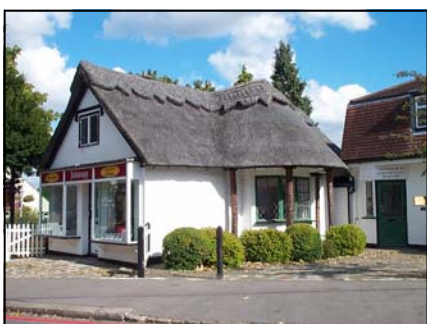
190 Wickham Road, Heathfield