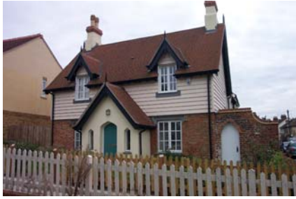
88 Woodside Green, Woodside