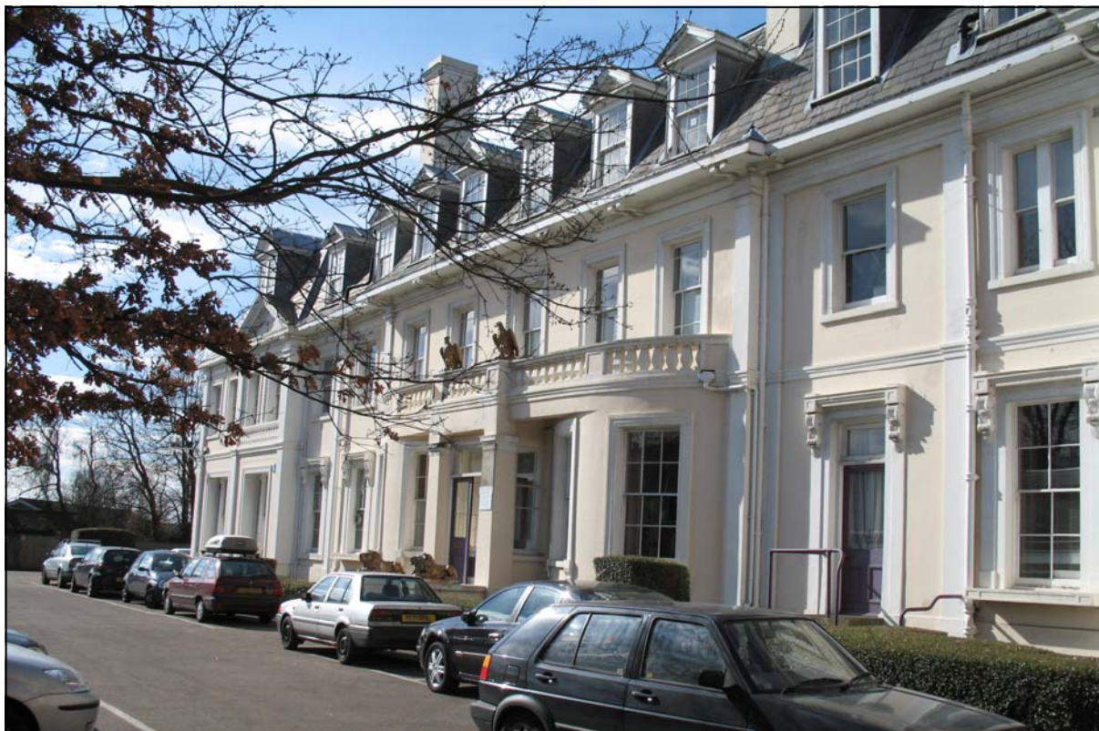
St Joseph's College, Beulah Hill,