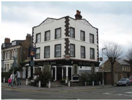
The Clifton Arms PH, Clifton Road, Selhurst

Owners are encouraged to carry out regular maintenance in order to safeguard the historic fabric and avoid the need for more costly repairs in the future. Continued inclusion on the Local List may help in maintaining the value of the property.