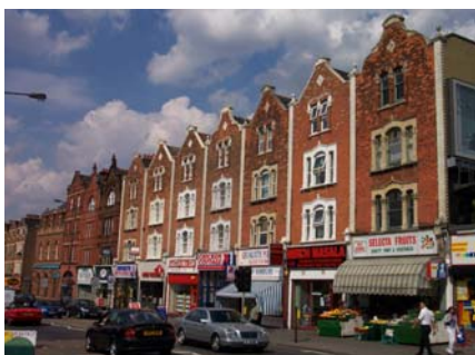
1414-1426 London Road, Norbury