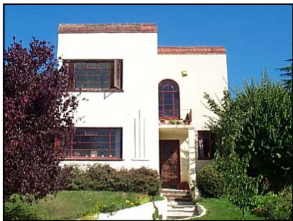
45 Brancaster Lane, Purley

“ Many buildings which are valued for their contribution to the local scene, or for local historical importance, will not merit Listing. It is open to Planning Authorities to draw up lists of locally important buildings, and to formulate local plan policies for their protection, through normal development procedures. ”