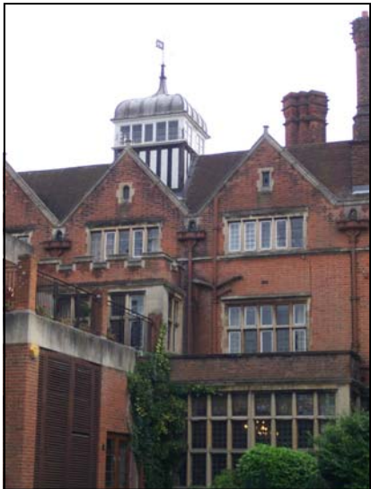
Selsdon Park Hotel, Addington Road, Selsdon and Ballards

The Council will seek to ensure that when planning permission or Conservation Area consent is required for alterations, the building's local interest will be a material consideration in determining such applications. Unlike Statutorily Listed buildings, there are no additional planning controls which affect Locally Listed buildings and so the Council has limited powers to control demolition of Locally Listed Buildings except in Conservation Areas.