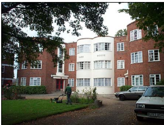
York House, Selhurst Road, Selhurst