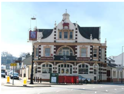
The Red Deer PH, Brighton Road, Croham