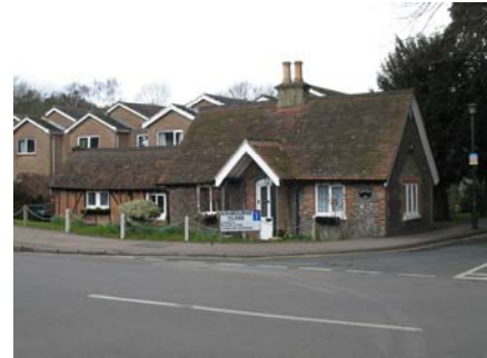
Ashdown Park Lodge, Ashbourne Close, Coulsdon East