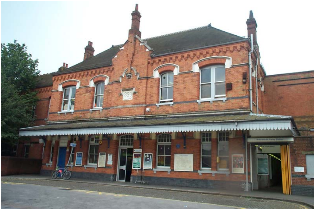
Purley Station, Station Approach, Purley