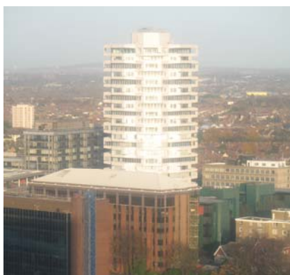
NLA Tower, Addiscombe Road, Fairfield