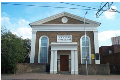
Baptist Chapel, Tamworth Road, Broad Green

6.1 Anyone can nominate a building for inclusion on the Local List. It is intended that the List will be reviewed bi-annually.