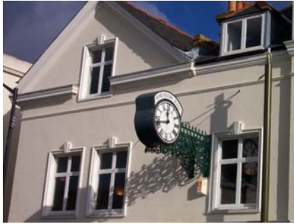
Foresters Hall, 35-37 Westow Street, Upper Norwood

Development rights. However, owners are encouraged by the Council to consider the special local interest, design quality and appropriate materials.