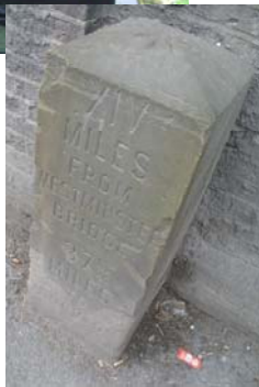
Milestone, Brighton Road, Coulsdon West

3.1 In order to offer some degree of protection to these buildings and features which are only of local interest, the Government's advice to Local Planning Authorities is stated in Planning Policy Guidance 15: Planning and the Historic Environment (PPG15). This advises: