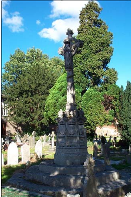
Memorial, Addington Village Road, Heathfield