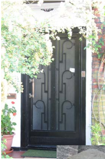
40 Eden Road, Fairfield