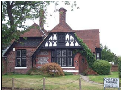
377 Wickham Road, Shirley