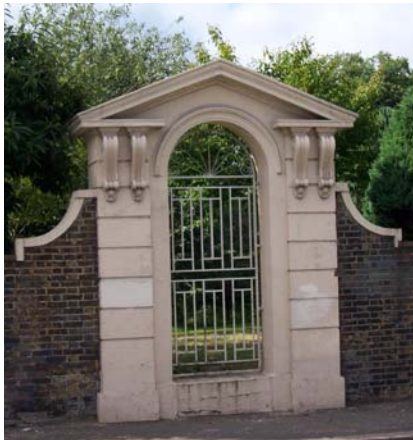
Westow Park Arch, Church Road, South Norwood