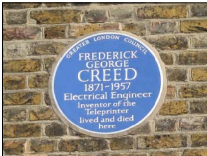
20 Outram Road, Addiscombe