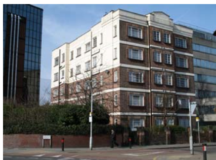
Georgian Court, Cross Road, Addiscombe