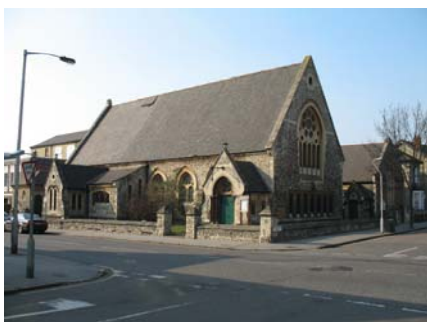
South Croydon United Church, Aberdeen Road, Fairfield