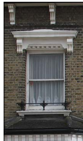
145 Brigstock Road, Bensham Manor