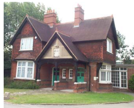
The Lodge, Mitcham Road, West Thornton