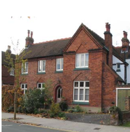
31 Elgin Road, Addiscombe