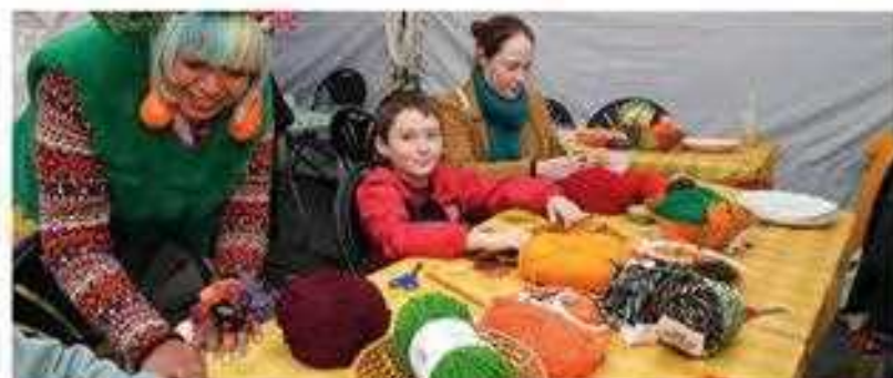
Children enjoying craft activities from weaving to collaging