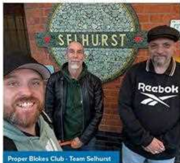
Proper Blokes Club - Team Selhurst