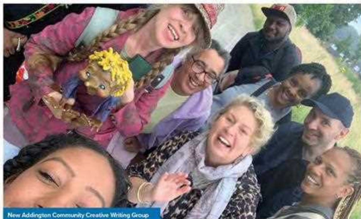
New Addington Community Creative Writing Group