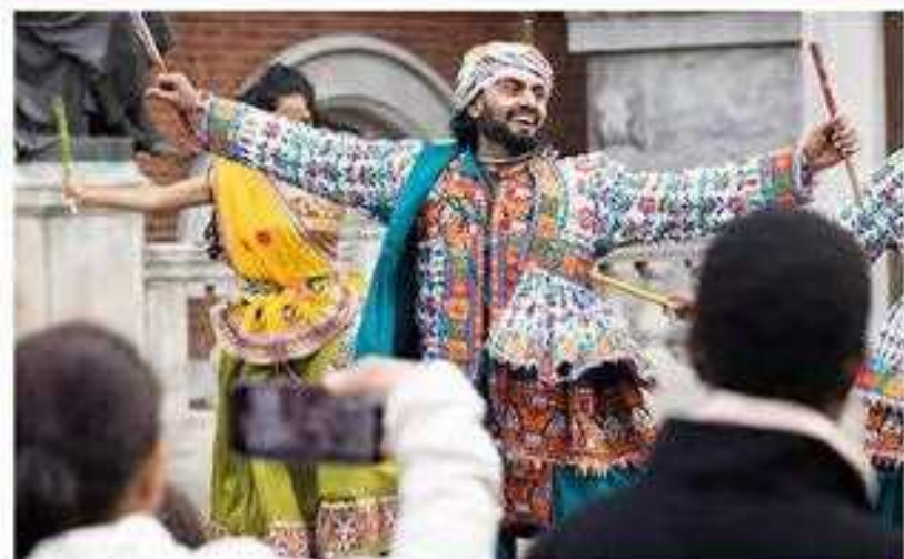
Gujarati Garba dance