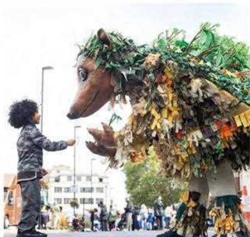
Hope the Hedgehog greets visitors

Croydon Harvest returned in a swirl of autumn colour – and a gust from Storm Amy! Inspired by the centuries old tradition of Croydon's Walnut Fair (1314 – 1868), the weekend brought giants, dancing, storytelling and crafts as families gathered to celebrate hope, heritage and harvest.