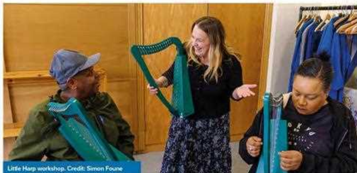
Little Harp workshop.