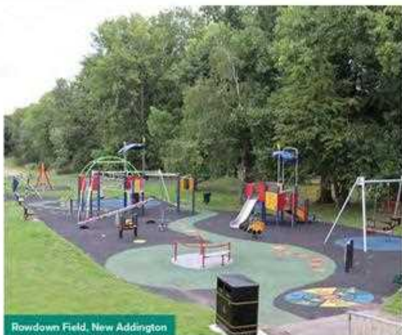
Rowdown Field, New Addington