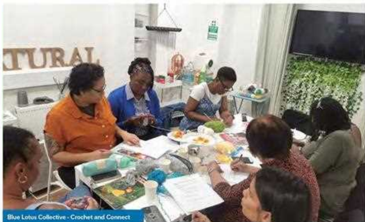
Blue Lotus Collective - Crochet and Connect