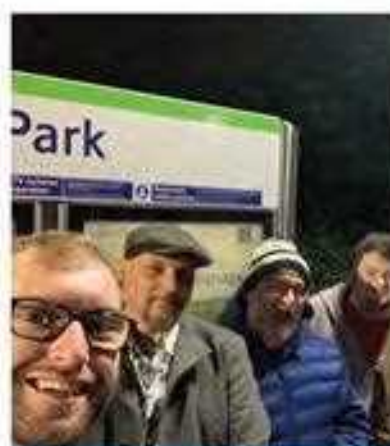
Proper Blokes Club - Team Lloyd Park