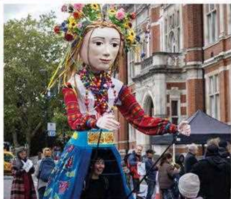
Giant puppet Sofia, Ukrainian Carnival Queen, delights the crowds