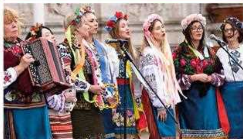
Choir Chervona Kalina perform Ukrainian folk songs