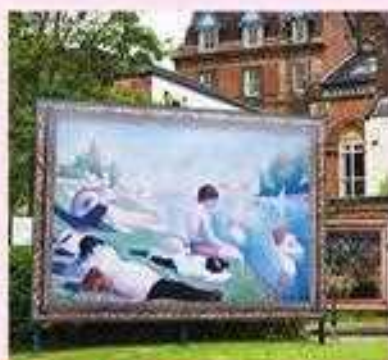
Art On Your Doorstep in Stoke-on-Trent - the first location the National Gallery visited with this project.

Which Croydon library did Constable's painting The Cornfield visit during our year as London Borough of Culture in 2023?