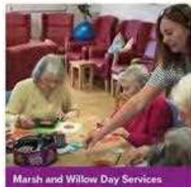
Marsh and Willow Day Services