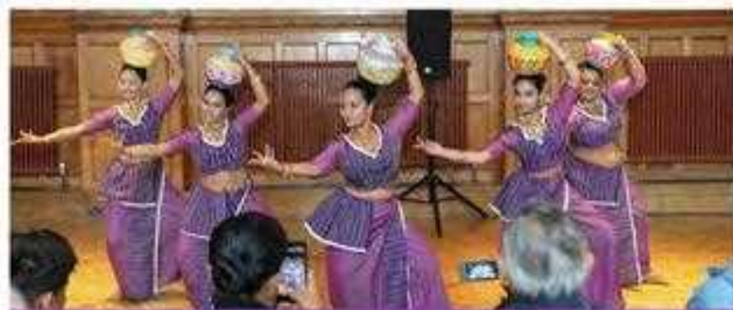
Traditional Karagam folk dance from South India