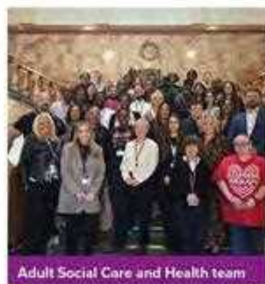
Adult Social Care and Health team

We will keep working with residents and partners to build on this success and improve services for all.