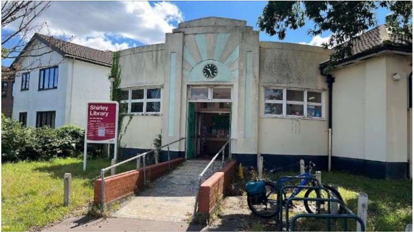
Shirley Library Building, Wickham Road/Hartland Way, Shirley, CR0 8BH

Indicative net internal area 279 sq m (3,000 sq ft)