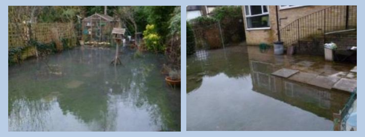
Figure 2: Flooded gardens during 2014 event (Croydon, 2015)

The Merstham Bourne, an ordinary watercourse near Coulsdon South Station, caused flooding to nearby residents' gardens in the winter of 2014. In January and February 2014, there was an increase of around 300% and 270% of the normal average rainfall for those months respectively. This event also caused disruptions to the nearby railway and nearby residents reported that lack of ditch and culvert maintenance led to the wider flooding of the area (Croydon, 2015). Specific details are outlined in the Merstham Bourne Flood Investigation Section 19 report.