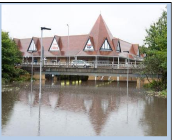
Figure 1: Purley Cross underpass (Croydon, 2015)

The deepest flooding was experienced in the pedestrian underpass beneath the roundabout (Figure 1), where it was reported to be approximately