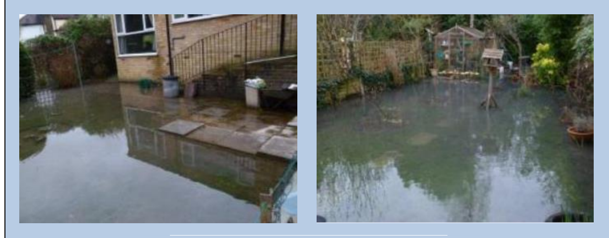
Figure 6: Flooded Gardens from Merstham Bourne (Croydon 2015)

The groundwater in the underlying chalk geology rose to exceptionally high levels as a direct result of prolonged rainfall throughout the month. This led to the emergence of springs in the area, causing bournes to flow in Croydon. Furthermore, high groundwater levels led to the exacerbation of other flood types. For instance, surface water flooding was made worse by the lack of infiltration due to saturated soil from high groundwater levels. Fluvial flooding was also worsened as Mersham Bourne only flows at times of high groundwater level. The Section 19 report documented this flood event in detail and Croydon are able to use this to better manage flood risks in the future. The report investigated the effectiveness of the relevant RMAs and provided future recommendations as well as lessons learnt. In 2019, Croydon LLFA collated all asset information into one system to develop a comprehensive picture of their assets and associated flood risk.