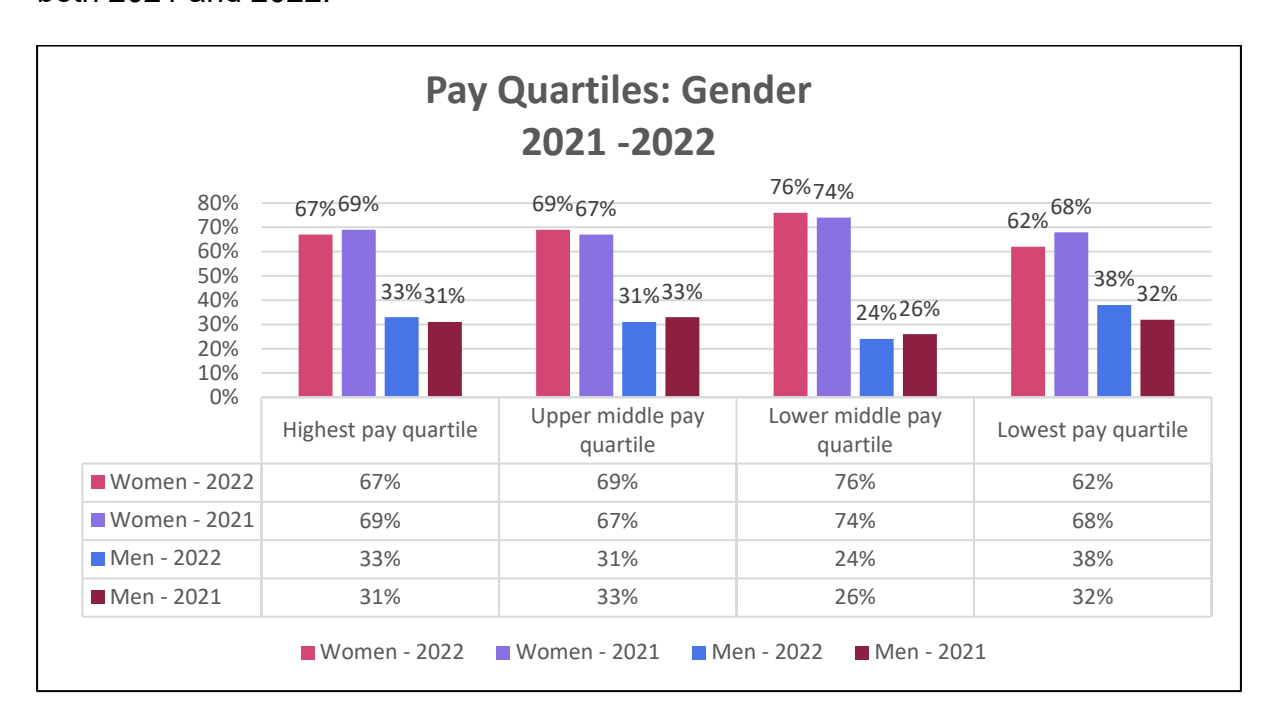
Figure 3: Chart showing pay quartiles for Croydon staff calculated via gender (male and female) in 2021 and 2022

The highest and upper middle (top \frac{1}{2} ) paid quartiles show representation of female employees at similar levels to their workforce representation (68%) for both 2021 and 2022.