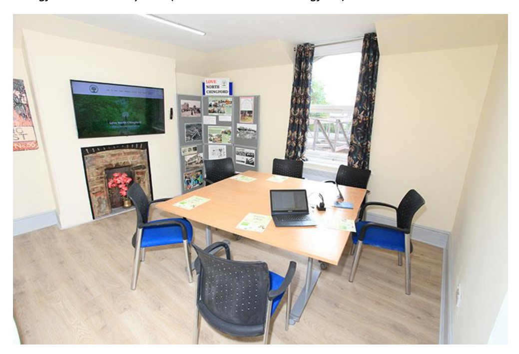
Chingford community hub