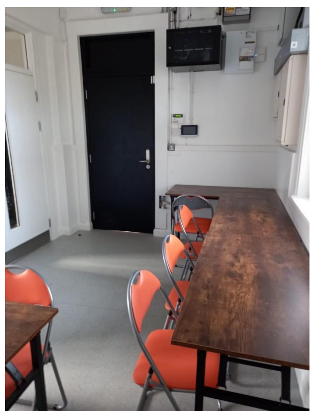
Highams Park community hub: