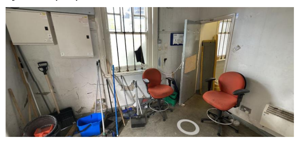
Highams Park before refurbishment: