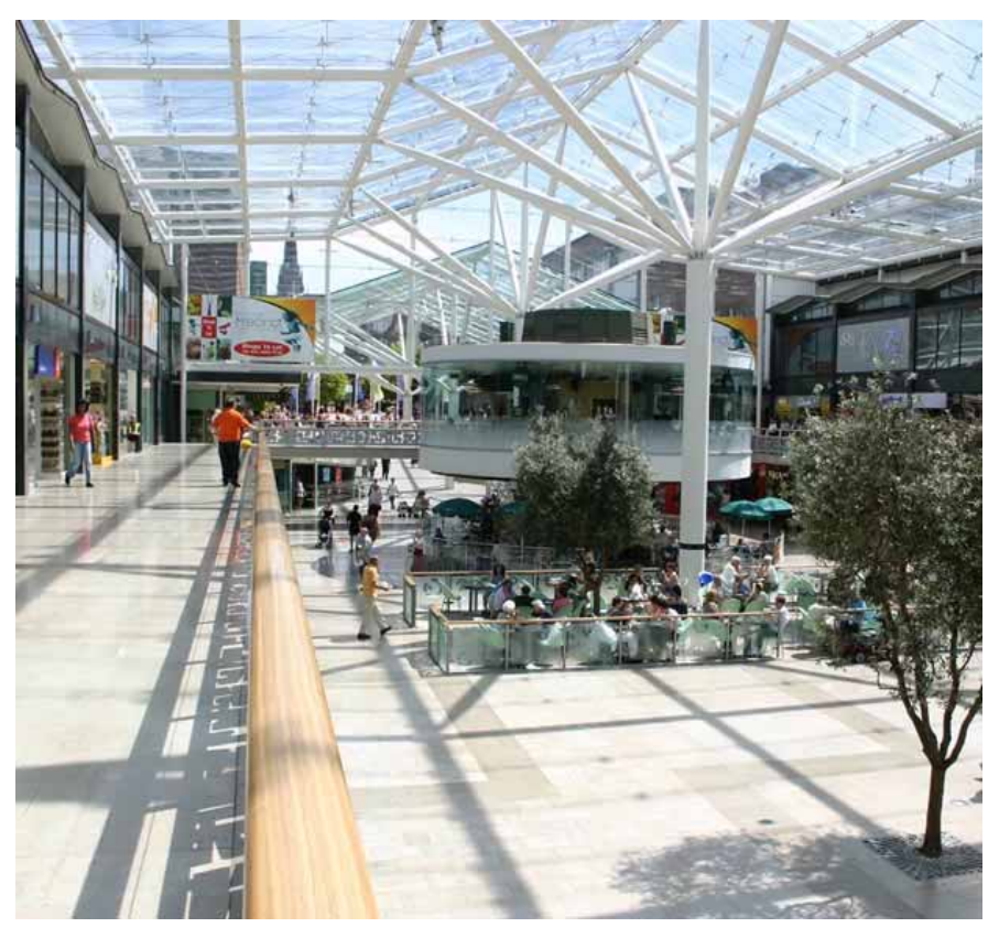
This attractive and well maintained shopping precinct draws people in.

(Refer to MI5 booklet Protecting Against Terrorism, available from the Home Office website and Appendix C for contact details for further advice).