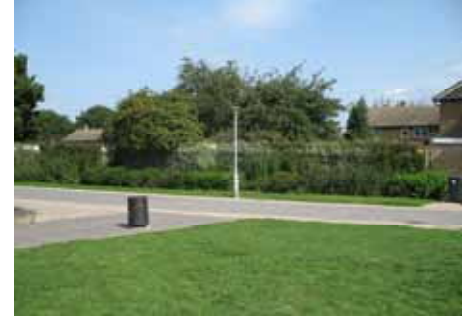
In addition to fencing, the use of planting can define site boundaries.