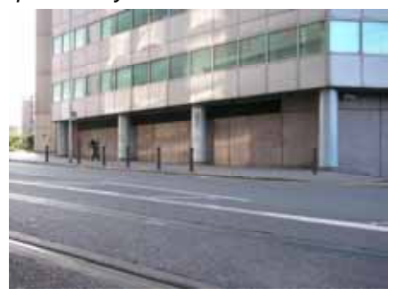
The ground floor of this office has no windows or doors. It is an attractive opportunity for vandals.

A mix of appropriate uses should be provided within commercial centres to attract a range of users, in terms of gender, age, mobility and incomes and at all times of the day and evening. This can include residential, with an outlook over the public street, above shops and offices to encourage activity and natural surveillance. Pedestrians can provide effective eyes looking onto the street and an attractive and well designed town centre is likely to draw people in.