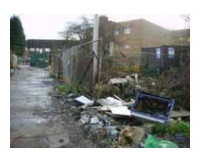
Signs of disorder and vandalism encourage crime and should be removed as soon as possible. A regime of removal sends a message that crime is not tolerated.

(Refer to Section 4.2 and 4.5 – Sense of Ownership).