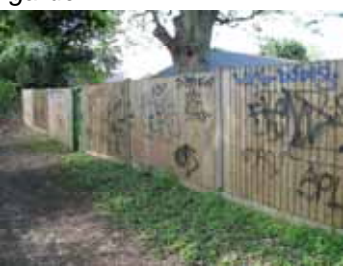
Routes with little overlooking are easy targets for vandals.