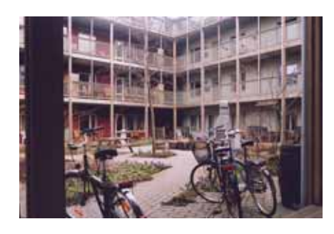
The residents of this housing block in Sweden benefit from a secure internal courtyard. Access to it is completely unrestricted as the space is protected by natural surveillance and activity.

Where large numbers of people share a common entrance and people find it increasingly difficult to recognise each other, a concierge system can make residents feel more secure in their homes.