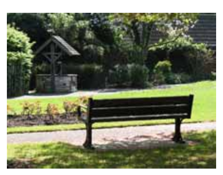
Open spaces should serve a purpose and be attractive to everyone or they risk becoming 'no go' areas .

Designers should try to anticipate preferred routes through open areas. These invariably follow the shortest route. The result of unrecognised desire lines are improvised footpaths that occur in unexpected places, thus undermining the planning and security of the space.