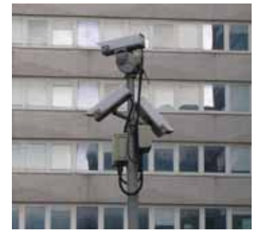
Cameras must take account of the context, as they can add to visual clutter in the street scene. Whilst they can give reassurance, the obvious presence of cameras can add to the perception that crime is present.