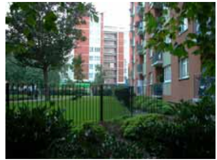
This is a good example of housing renewal. External space has been enclosed and a playground Provided.

The Cromer Street area in Camden has been used as a case study in the ODPM's Safer Places document.