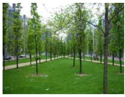
This urban park in Brussels has visibility below the tree canopy for users to feel comfortable and be seen by others.