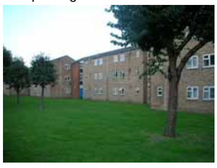
The open space in front of these flats does not feel like it belongs to the residents.