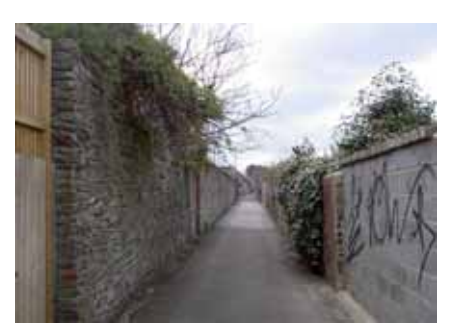
No graffiti has been applied to the rough stone wall.

Textured surfaces, intended to disrupt the overt impression of the paint is one way of tackling graffiti. In this example trellis was added but only worked as a deterrent to graffiti where there was planting too.