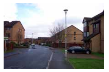
A single-use-housing estatepotentially a lack of activity in daytime-attractive to burglary as the perception is that there is no one around and the criminal will be undetected.