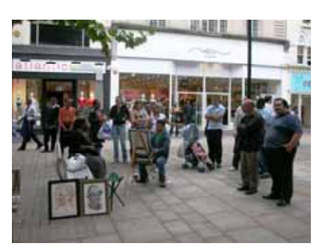
Outdoor activities which attract groups of people promote a collective identity which can foster feelings of community and ownership.