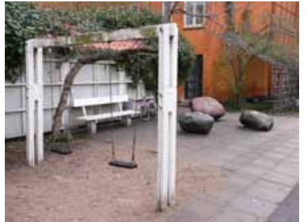
Small outdoor spaces needn't be turned into parking spaces. This courtyard in Copenhagen is now a play area with seating.