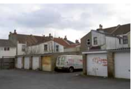
Although this space is overlooked, it is physically isolated from the houses. By the time residents can reach the garages, any vandals will have gone.