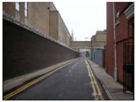
Although clear and direct, this street is intimidating, lacking both activity and overlooking.