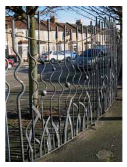
Street furniture can be attractive AND provide physical protection.