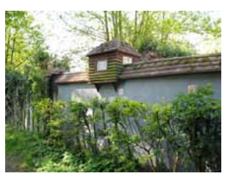
Planting to protect a blank wall.

Graffiti can be discouraged in a number of ways. Along with providing blatant overlooking or defensible space, the size of the blank wall can be broken up or reduced to discourage graffiti. As a reactive measure, an anti-graffiti coating can ease removal. The graffiti must be removed promptly to maintain a sense of care for the environment and if a coating is applied to mask the graffiti it should be sympathetic to the appearance of the building. (Refer to Section 7 on Management and Maintena nce).