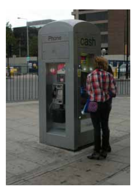
ATM 'phone booths' should be sensitively located where they will not be the focus of vandalism and where people can be seen using them. Care should be taken to avoid them becoming another piece of street clutter.