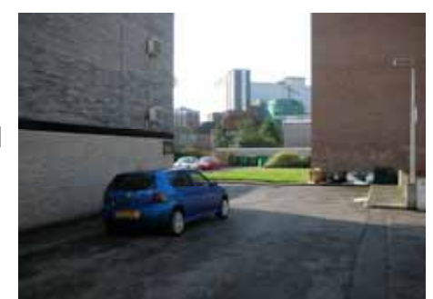
There is no overlooking of this space. Residents have found a convenient place to dump rubbish where it can remain unseen.

A balance needs to be struck between the needs of car ownership with the desire for safe and pleasant streets. The visual impact, noise and movement generated by large areas of parking must be mitigated. Parking arrangements have to be flexible and must be integrated in the design process.