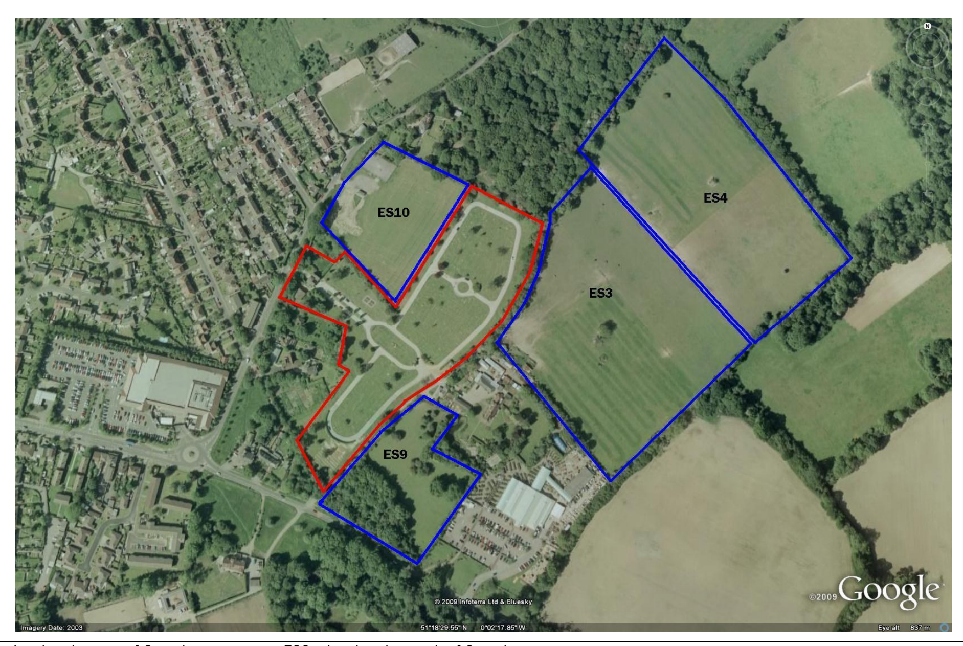
ES3 – Land to the east of Greenlawn ES4 – Land to the northeast of Greenlawn