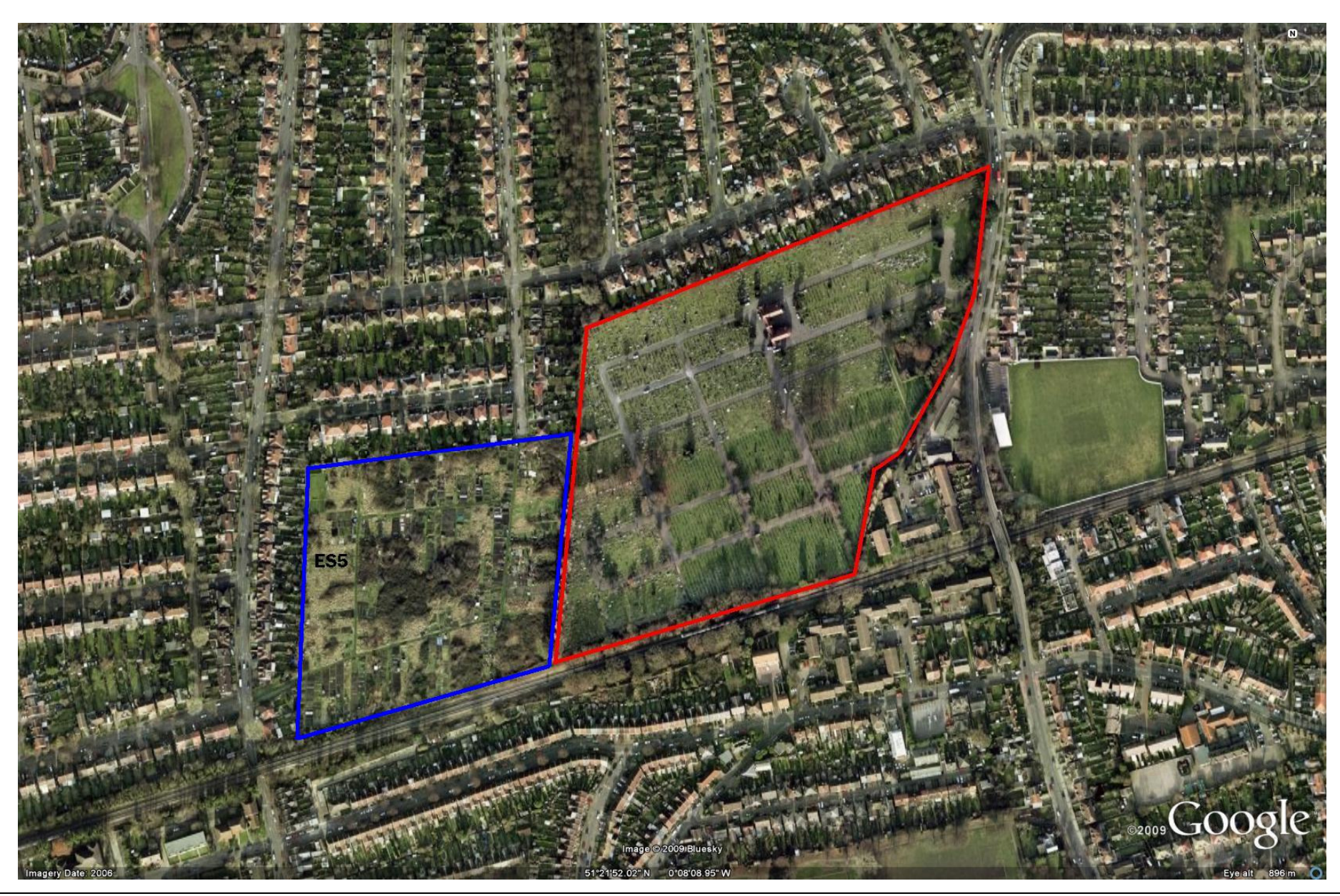
ES5 – Demesne Road Allotments